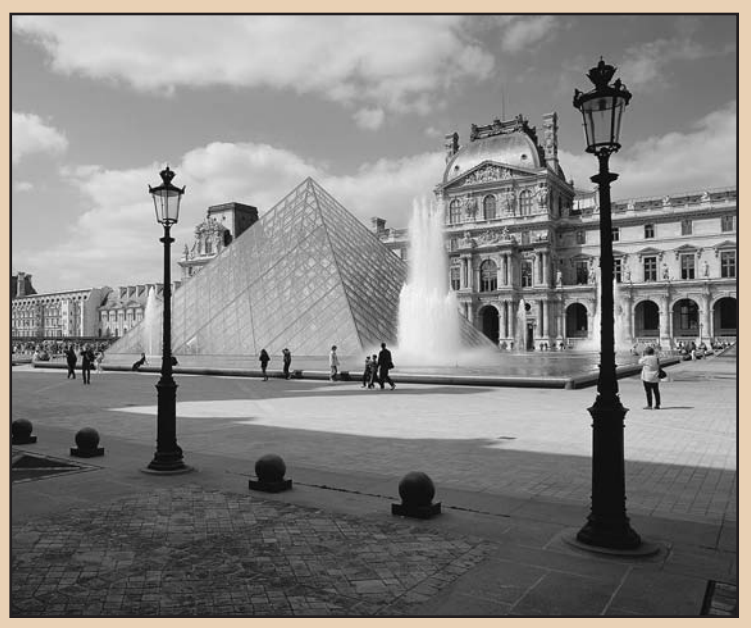
Paris, Louvre Museum & Pyramid