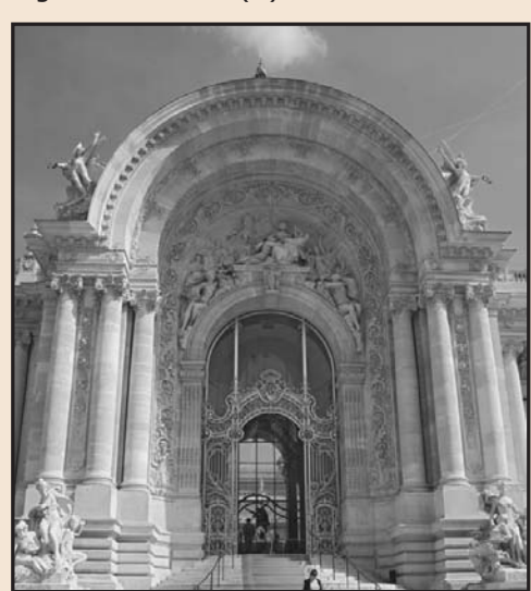
Paris, Petit Palais

August 4/Tues. PARIS/NEW YORK Transfer to the airport for your return flight to the U.S. (B)