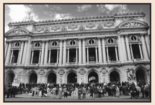
Paris, Opera Garnier

FRANCE Highlights of Paris Paris, France