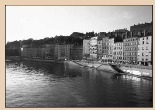
Lyon, Vieux District & Saone River

August 2/Sun. PARIS Transfer to the Villepinte Expo Center to attend the International Convention of Jehovah's Witnesses. (B,Box L)