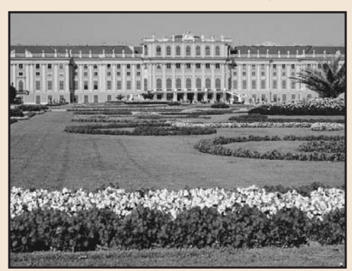
Vienna, Schonbrunn Palace

Tour may also operate July 26-August 5 with one less night in Vienna with a reduction of $70.