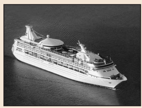
Royal Caribbean Vision Of The Seas

August 8/Sat. STOCKHOLM/NEW YORK Transfer to the airport for your return flight to the U.S. (B)