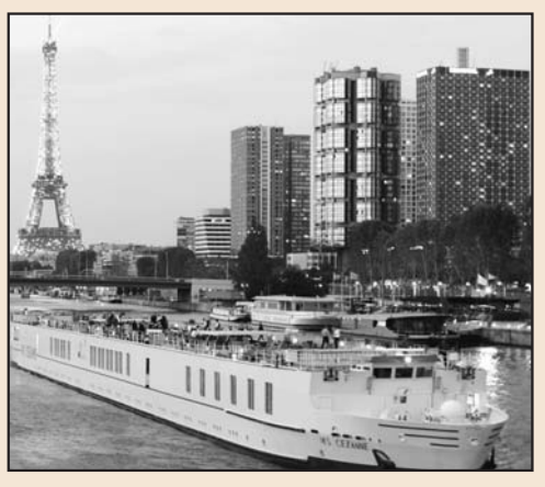
Dielmann MV Cezanne

August 12/Wed. COPENHAGEN/ NEW YORK Transfer to the airport for your return flight to the U.S. (B)