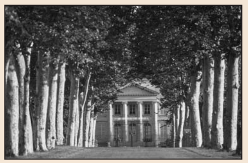
Bordeaux, Chateau & Vineyard

August 3/Mon. PARIS/NEW YORK Transfer to the airport for your return flight to the U.S. (B)